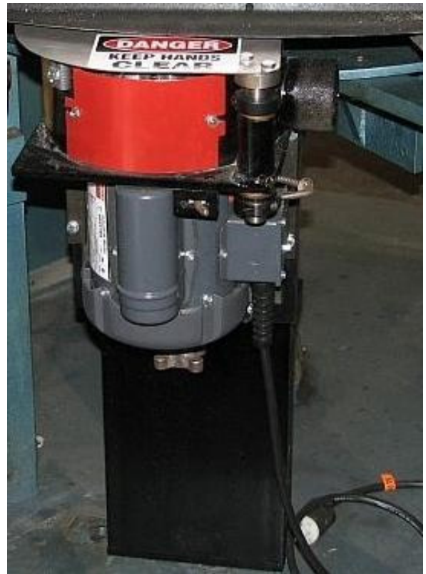
Mounted and ready for WORK !